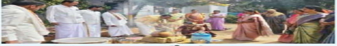
ముందస్తు సంక్రాంతి సంబరాల్లో ఉపాధ్యాయులు,విద్యార్థులు